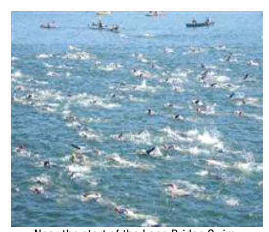
Near the start of the Long Bridge Swim

"As long as you can make out the bridge, you'll be okay," a veteran swimmer assured me.